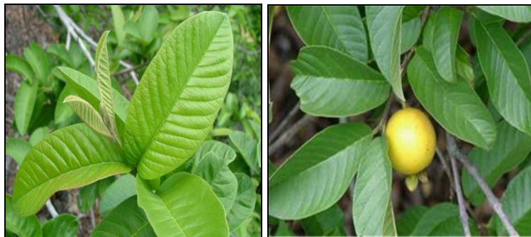
Fig 1: Whole Plant of Psidium guajava