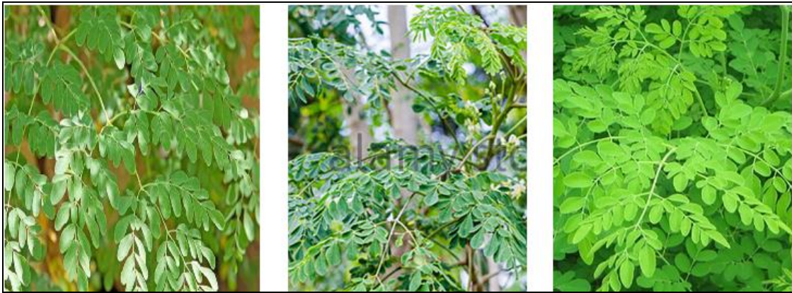
Fig 1: Whole Plant of Moringa oleifera