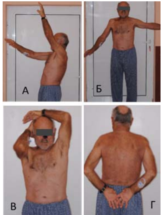
Fig 2: Degree of mobility in articulation humeri: 1 – anterior flexion, 2 – lateral elevation, 3 – external rotation, 4 – internal rotation

Methods. Impaired shoulder function after neck surgery was evaluated by Constant Shoulder Score (CSS), as it is considered gold standard in Europe [23]. It is composed of 4 parts: first part - PAIN - reported (evaluated) by the patient and scored with a maximum value of 15 points; second part - Daily Activity - reported by the patient and scored with a maximum value of 20 points; the third part - MOBILITY RATES - evaluated by the clinician and scored with a maximum of 40 points (Figure. 2); the fourth part - POWER - evaluated by the clinician and scored with a maximum of 25 points (Figure. 3). A fully functioning arm has a higher value on the scale, with a maximum score of 100. The values obtained are grouped into four stages.: poor functioning – less than 30 points, limited functioning – 30 to 39 points, good functioning – 40–59 points, very good functioning – 60–69 points, excellent functioning over 70 points.