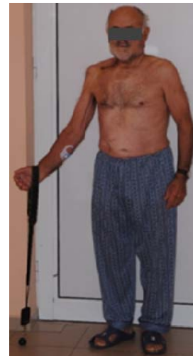
Fig 3: Measurement of abduction force by an isometric tensiometer